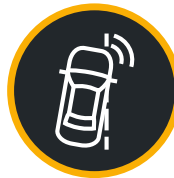
Lane Departure Warning (LDW)