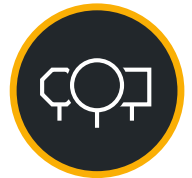
Road sign recognition