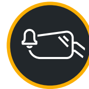
Blind spot monitor