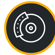
Autonomous Emergency Braking (AEB)